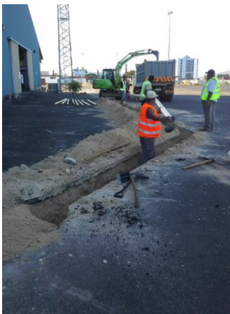
Laying of conduit for fiber optical cable

Project supply and installation of CCTV camera all along the MPA port area