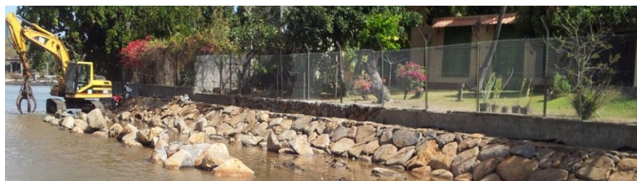
THE METHODOLOGY IS THAT A GRAPPER MOUNTED WITH AN EXCAVATOR WILL BE USED TO INSTALL THE ROCKAMOUR ALONG THE DESIGN LINE AS PER THE STRUCTURE DESCRIBED