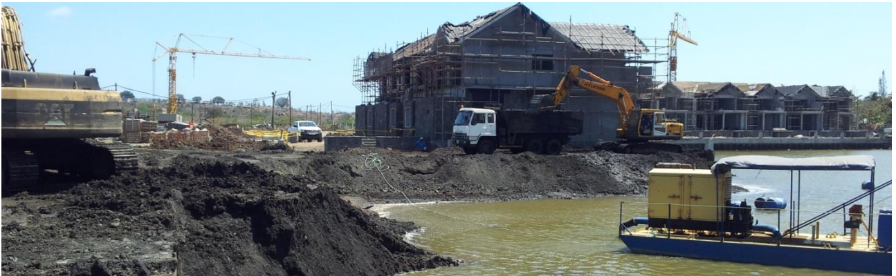
LABALISE MARINA PROJECT, DREDGING OF 70,000 CUBIC METER UP TO 6M DEEP FOR THE ACCESS OF LUXURIOUS BOAT