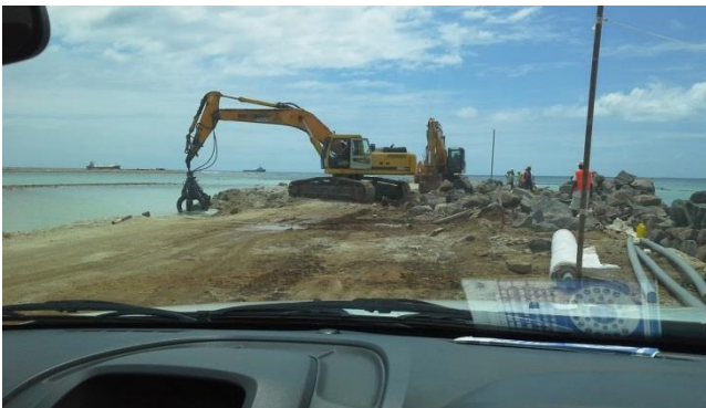
ROCK REVETMENT AND COASTAL PROTECTION WORK AT FORT WILLIAM AND FORT GEORGE MAUTITIUS PORT AUTHORITY