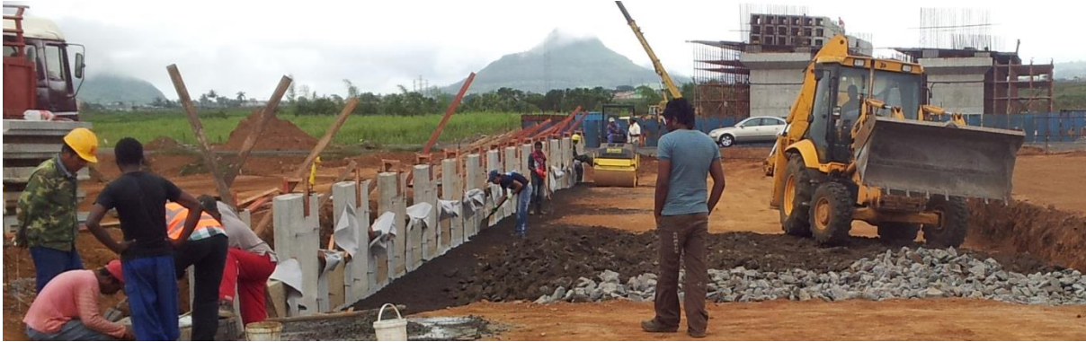
OUR TEAM ARE PREPARING THE BLINGDING AND ALIGNMENT FOR PRECAST PANEL