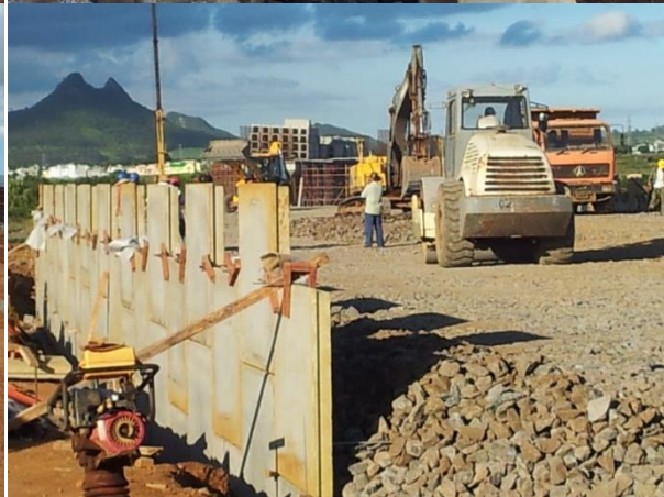
Erection in progress