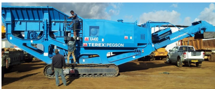
Mobile Crusher Premier Tack 1165 Terex Pegson